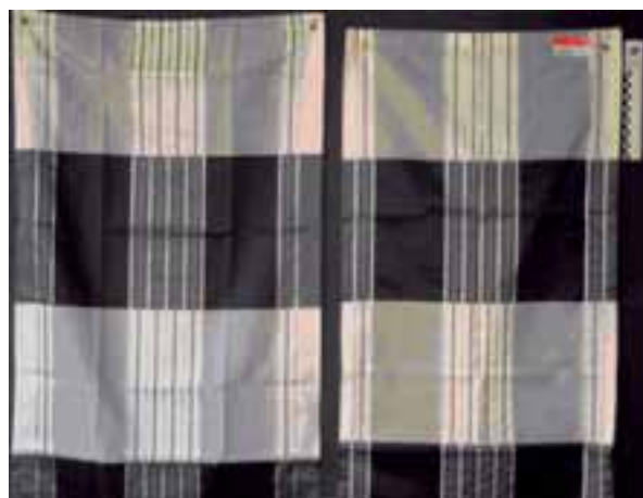
Fig. 3. Copy Original