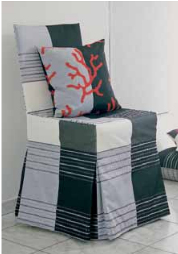
Fig. 1. Design of Alfred Apelt GmbH (www.apeltstoffe.de)