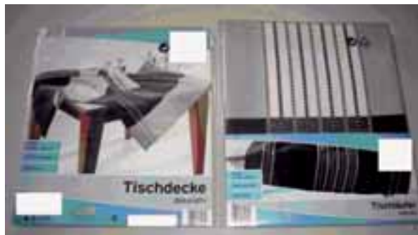
Fig. 2. Seized copy at discounter